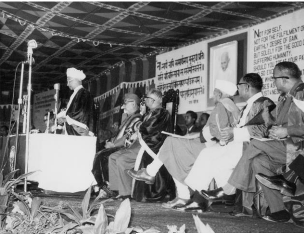
1<sup>st</sup> Convocation, 1963