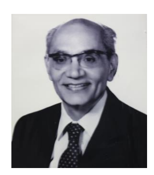
Dr. V. Ramalingaswamy

The AIIMSONIANS are unique individuals because they have set out to do something significant, work on important problems, have the courage to pursue independent thoughts, are high achievers at a young age, have a tremendous drive, are willing to work longer hours than contemporaries with equal ability, have high emotional commitment to their profession and have the capacity to present their achievements to the world. I have asked 5 of them if it was worth it? For they had an option to serve in many other Institutions of the country and abroad, and the common refrain has been that "It was worth it". The highest national recognitions have been bestowed on several AIIMSONIANS, with being Dr. V. Ramalingaswamy felicitated 3 times with Padma Awards including the Padma Vibhushan.